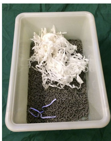
Cage 27cm(w) x 38cm(l) x 16cm(h)