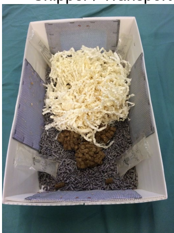
Large- 27cm(w) x 48cm(l) x 20cm(h) Total floor area 1296cm 2