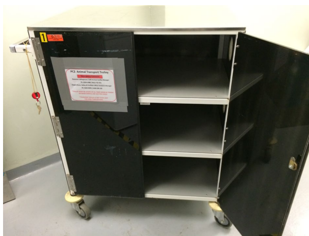
Lockable PC2 trolley