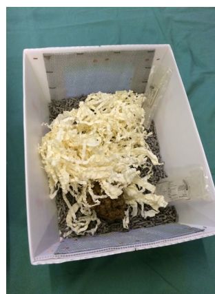
Small- 24.5cm(w) x 32cm(l) x 15.5cm(h) Total floor area 784cm 2