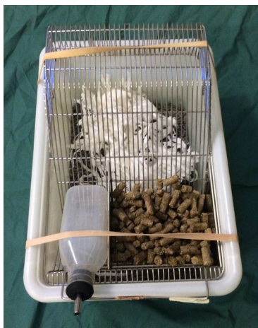
Cage secured for transportation